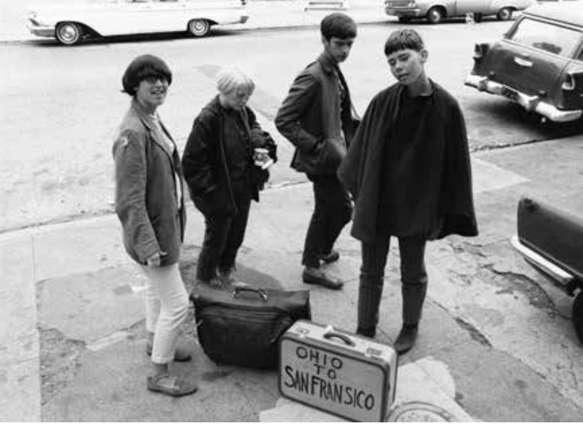
Ohio to San Francisco, 1967. Featured in On the Road to the Summer of Love, on view at the California Historical Society from May 12 through September 10, 2017.