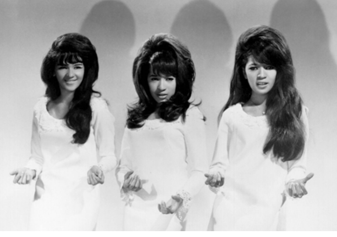
The Ronettes in 1966.

These groups were called "girl" groups for a reason. An estimated 1,500-plus groups were formed between 1958 and 1963, largely composed of young women aged 11 to 18. Entering the recording studio right out of school, they sang songs about things that mattered to them, such as love, the complexities of growing up, and strict parents. On the surface, it would appear that many of the songs in this genre upheld the traditional feminine values of the previous decade (chastity, modesty, demureness), but upon a closer look, there is a subversive undercurrent. Doo-wop language (such as "doo lang doo lang" in the Crystals' 1963 hit "He's So Fine") was often used to cover up references to sex and other "improper" activities. Sometimes even just cleverly disguised lyrics—"Is this a lasting treasure / Or just a moment's pleasure" in "Will You Still Love Me Tomorrow?"—could let these young women and their listeners explore taboo subjects.