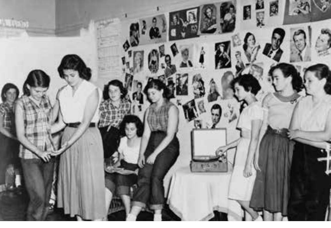
A woman teaches a group of girls how to dance in New York. Photo by Fred Palumbo, 1953. Courtesy Library of Congress.

A major beat hotspot was North Beach, a neighborhood in northeast San Francisco. There, the rent was cheap, the bars tolerant, and the atmosphere European—appealing to creative types who romanticized artistic countries such as France and Italy. In 1953, poet Lawrence Ferlinghetti opened up City Lights Bookstore there and began publishing books, including Allen Ginsberg's Howl in 1956. The poem, an impassioned and fiery lament on the state of modern society, became the subject of an obscenity trial that ultimately led to increased sales of the book and international attention on the San Francisco beat scene.