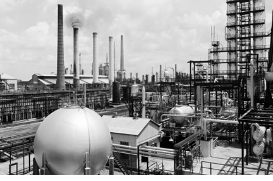
An oil refinery in Port Arthur, Texas.

remember, they were all singing along to a song by folk singer Odetta. Joplin was tired of them butchering it, so she broke out singing in a voice that sounded exactly like Odetta's. "Guess what?" she said. "I can sing."