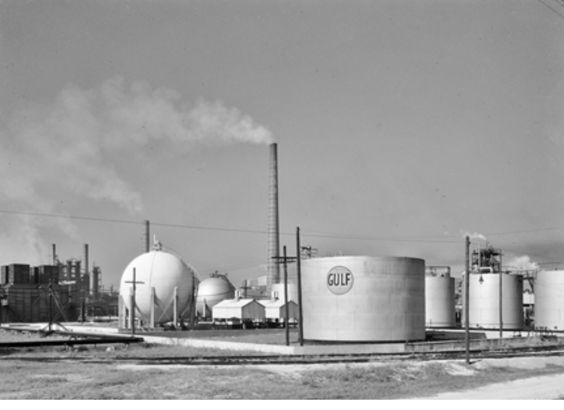
An oil refinery in Janis Joplin's hometown of Port Arthur, Texas.