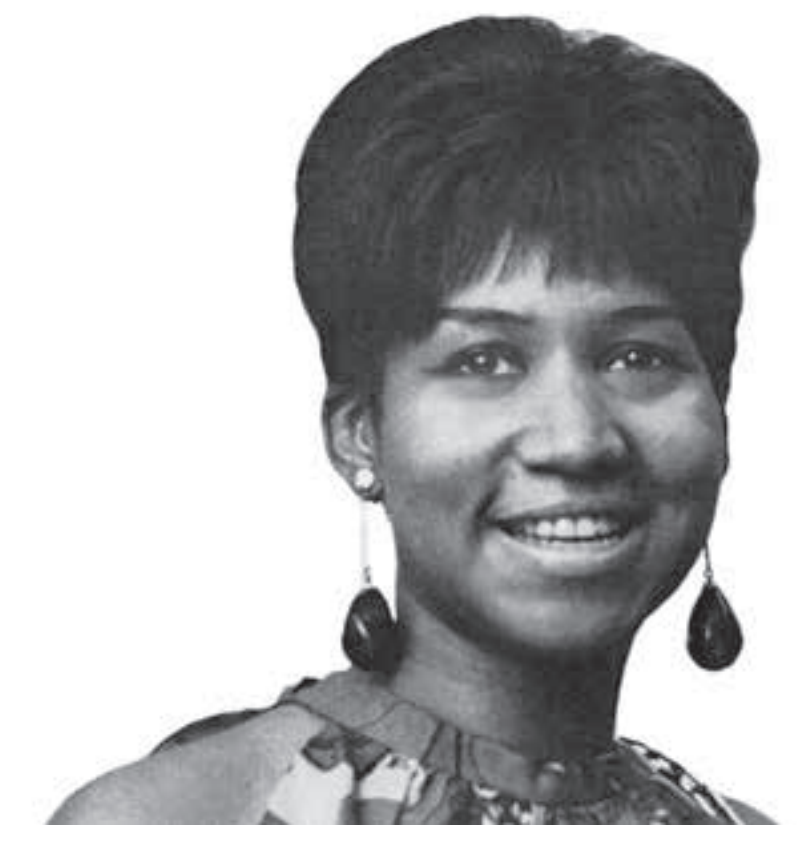
Aretha Franklin, 1967.