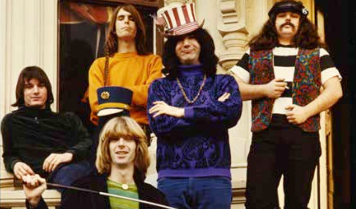
The Grateful Dead, c. 1966. Featured in On the Road to the Summer of Love, on view at the California Historical Society from May 12 through September 10, 2017.

San Francisco, where he founded and managed the band Big Brother and the Holding Company.