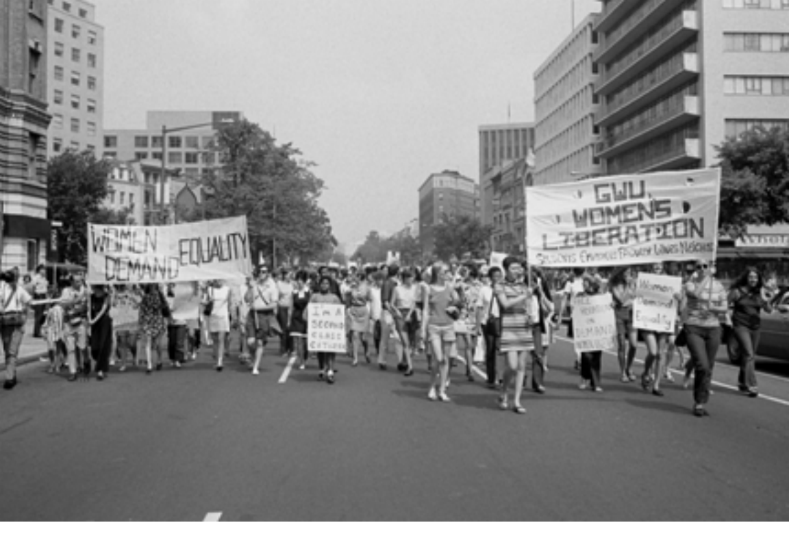
A women's rights demonstration in 1970.

"Women Is Losers," she asks the listener to consider how much a woman's place in society had really changed. "Men always seem to end up on top," says Joplin in the song's chorus.